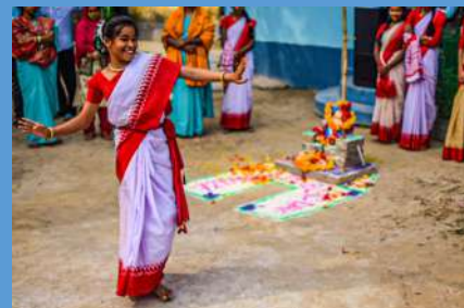
Republic Day Celebrations