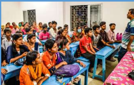
Student Sponsorships in Panikhal