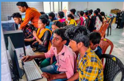
Computer Training Class