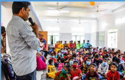
Inauguration of Boria Centre