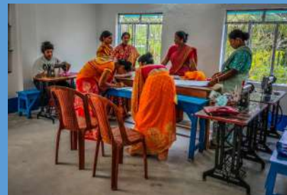
Tailoring Training in Boria