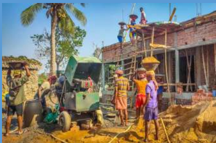
Construction of Boria Centre