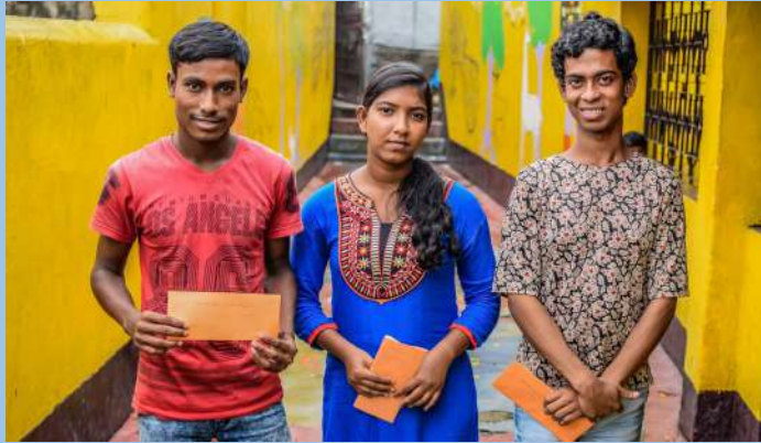
17 College Students Sponsored