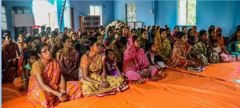
Mothers Meeting on limiting plastic usage