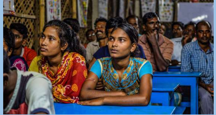
Class XI sponsorship