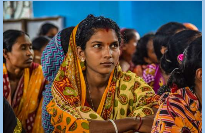
112 members of mothers self help groups