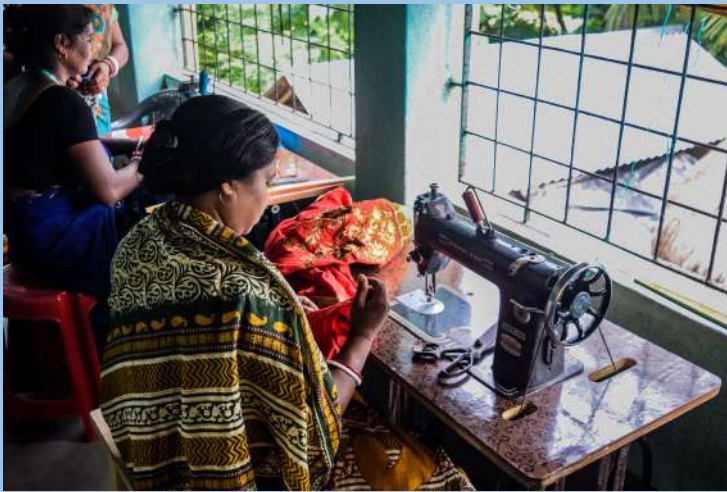
Vocational training to help mothers generate income