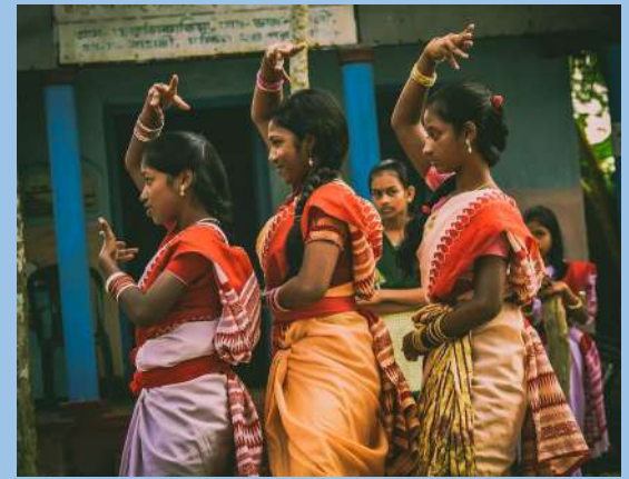
Cultural Performance in Alor Disha