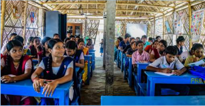
Student Capacity Building