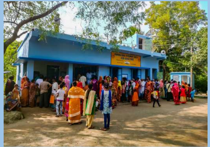
Opening of new Alor Disha Centre