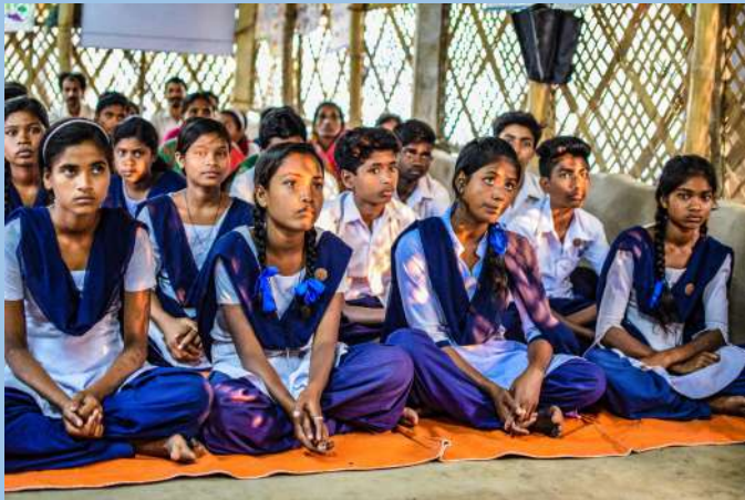
120 Secondary Students Supported