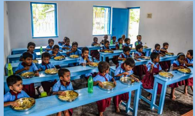
Infrastructure development in all PRDS Centres