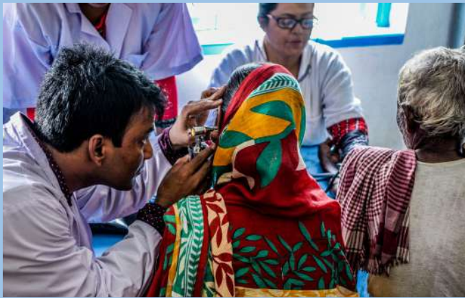
Health Camp in Alor Disha Centre