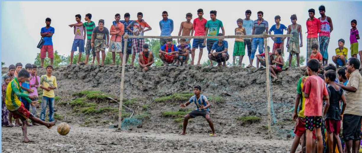
Football Tournament between all three PRDS Centres