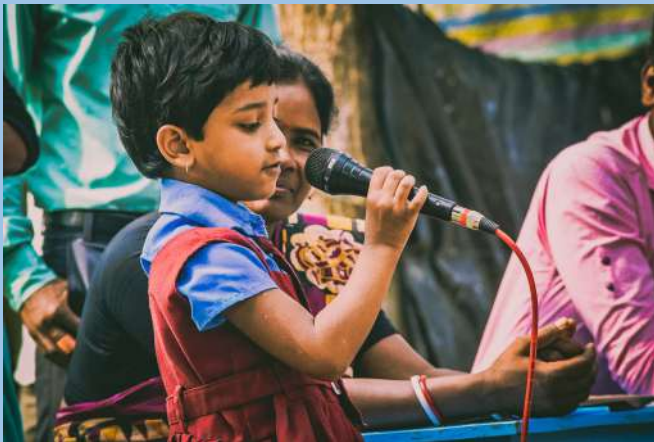
Programmes focused on child development