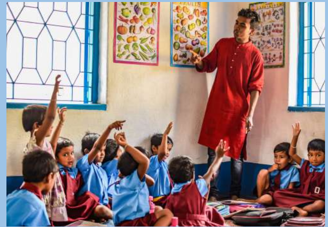
530 Students supported in our programme with PRDS